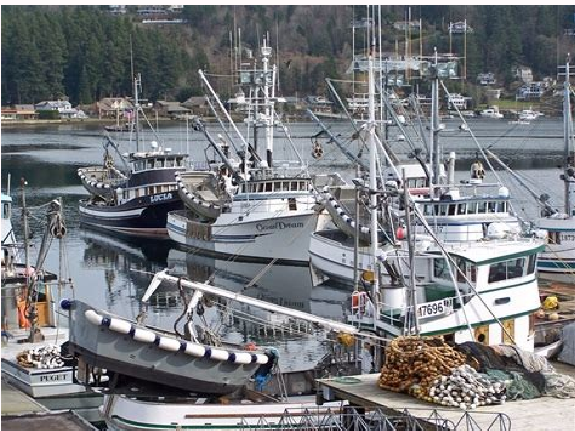
Fishing report durban.